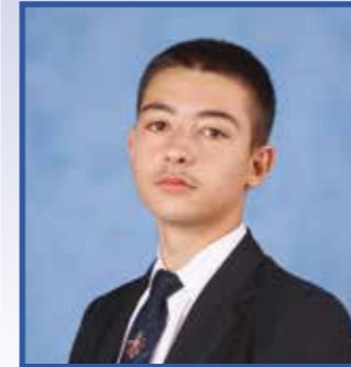
Albion C Year 10