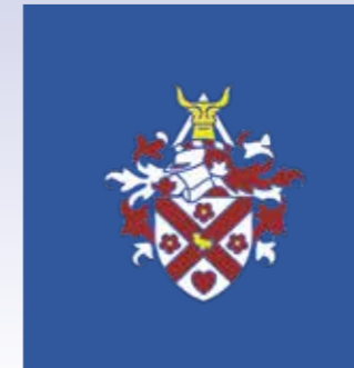
Jimmy K Year 8