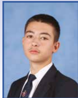
Albion C Year 11