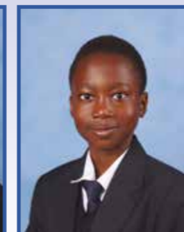
Sumad B Year 8