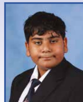
Basel A Year 8